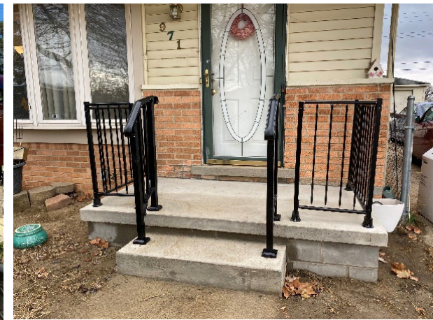
971 Nash After