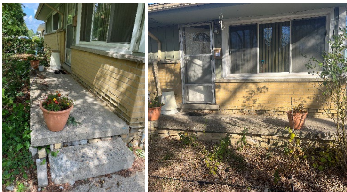
1169 Buick Before