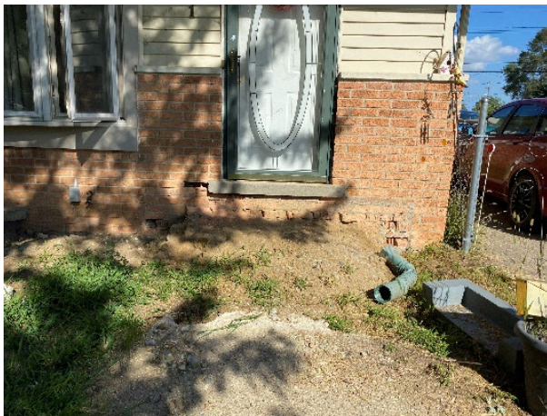
971 Nash Before