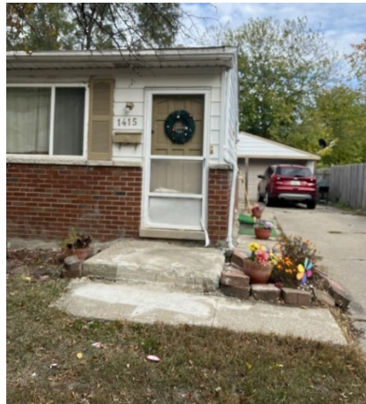
1415 Glengrove Before