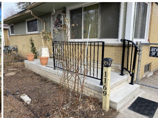
1169 Buick After