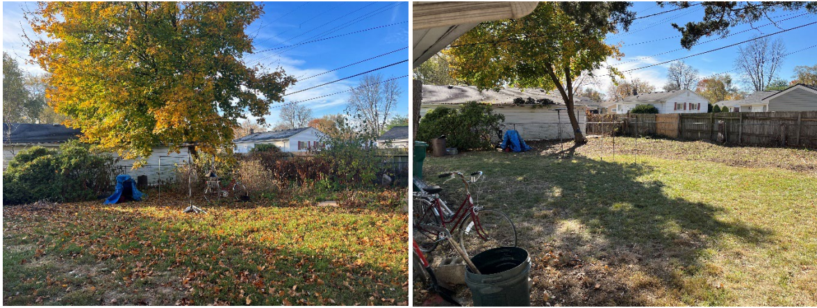
Back yard before and after