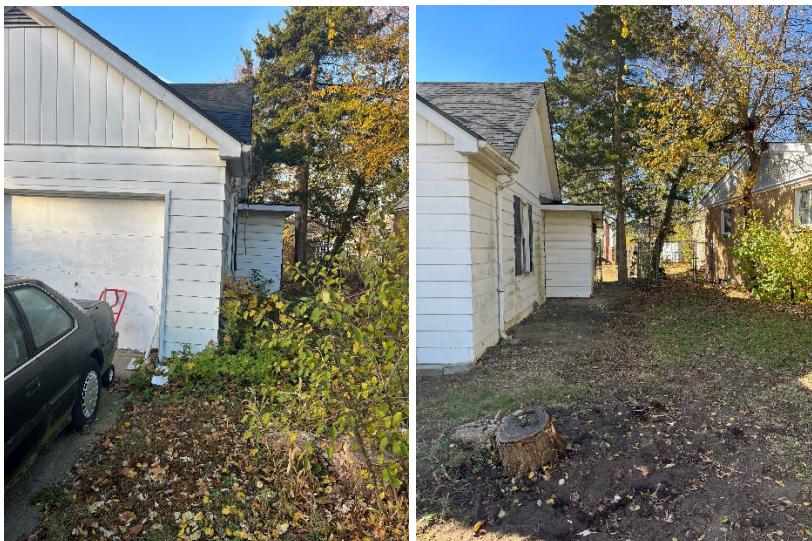
Side yard before and after