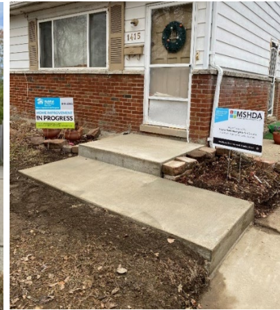
1415 Glengrove After